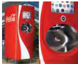
The Coca-Cola Company